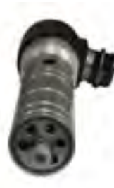
Internal diesel fuel vent