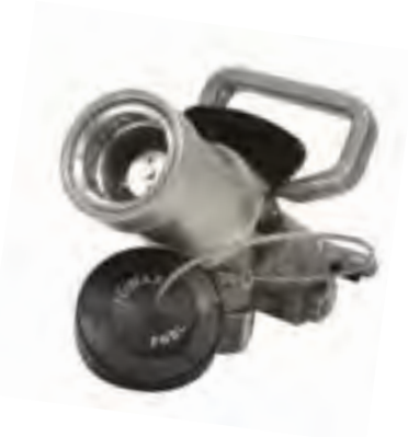
FN600BL 1 1/2" Fuel Nozzle w/ Ball Lock Nose Available with sealing plug or swivel