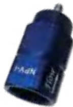
Internal diesel fuel valve