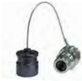
Diesel fuel receiver low pressure