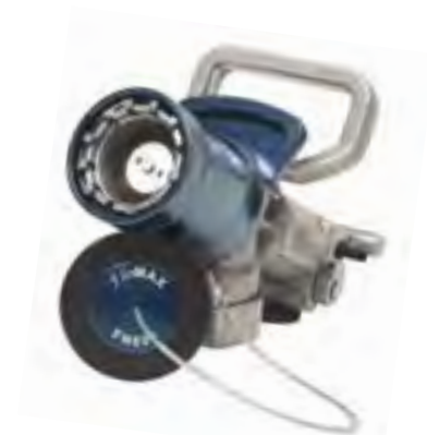
1 1/2" Fuel Nozzle w/ Dog Lock Nose Available with Sealing Plug or Swivel