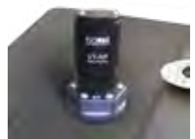
Example of a Vent installed in Plastic Tank