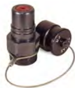
Bulk Diesel Fuel Receiver with Anti-Theft Technology