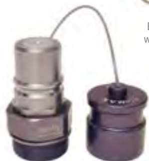
Bulk Diesel Fuel Receiver with removable sleeve