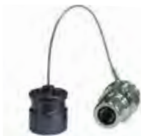
Diesel fuel receiver low pressure