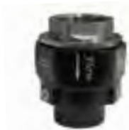
External non-pressure valve