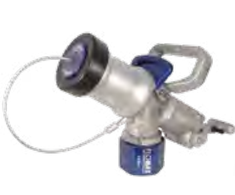
FN800 2" Fuel Nozzle w/ Ball Lock Nose Available with sealing plug or swivel